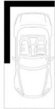
COVERED CAR SPACE 3.4 x 3m